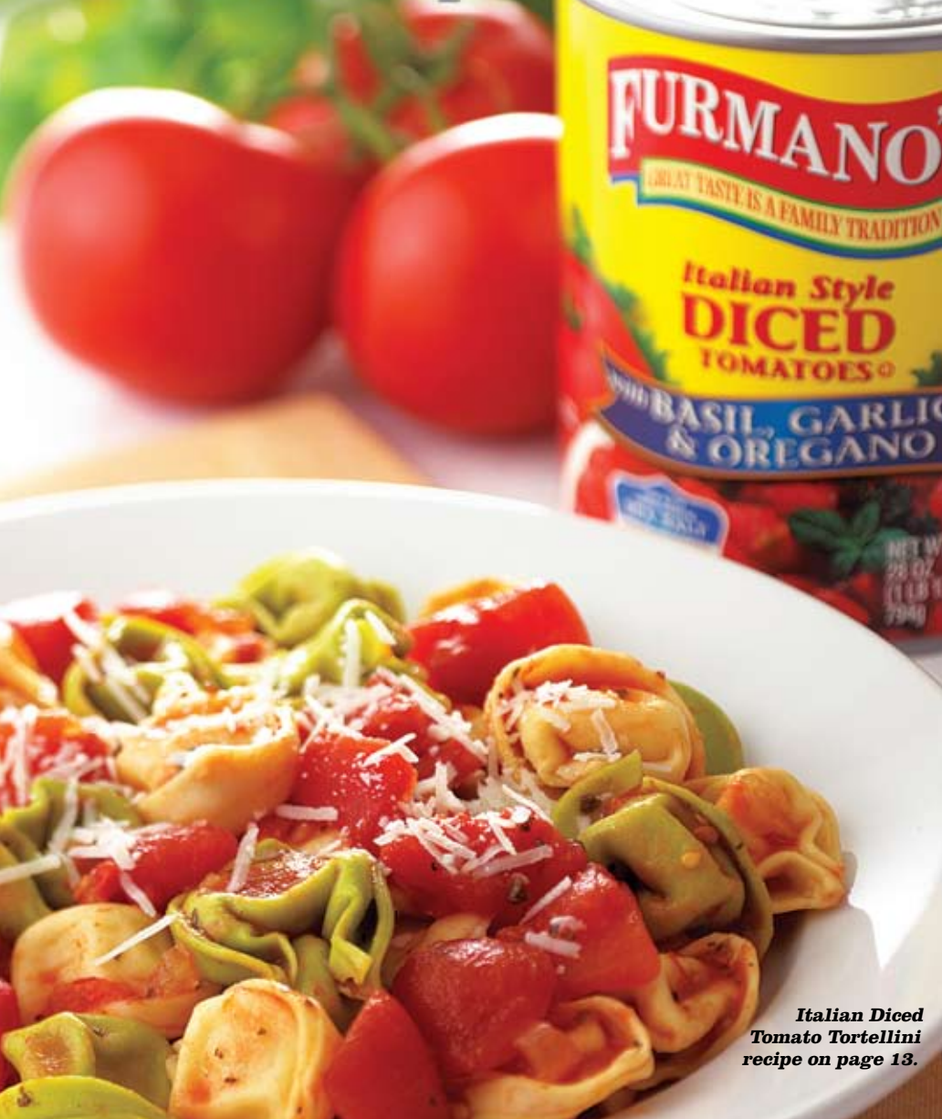
Italian Diced Tomato Tortellini recipe on page 13.

Harvesting Nature's Goodness For 90 Years